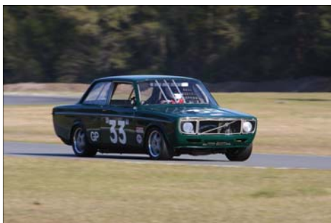
Les Chaney (#33, GP)